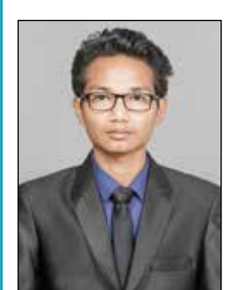
23 years B.E.(CSE) Jorhat Engg. College Dibrugarh University, Assam