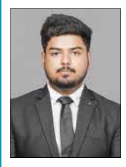
23 years B.E. (IT) U.I.E.T, Punjab University, Chandigarh